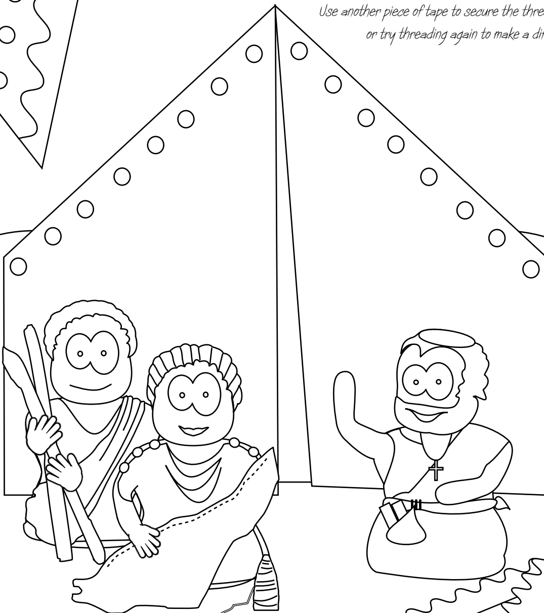
Priscilla, Aquila & Paul Tentmakers spreading the Gospel

or try threading again to make a different pattern.